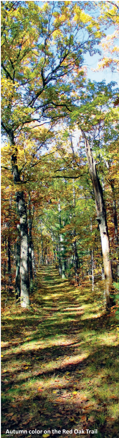
Autumn color on the Red Oak Trail